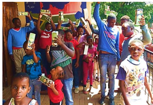
Happy children with biscuits from Woolies