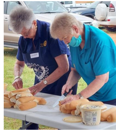
Rotarians and Anns helped make Wors Rolls.....