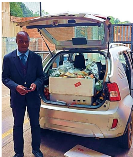
Car laden with food ready for Mashadza

Every Sunday, Woolworths donates their food that is about to expire to our club for Mashadza Special Care Centre. We were very fortunate over the festive season to get much needed food for many people at Mashadza.