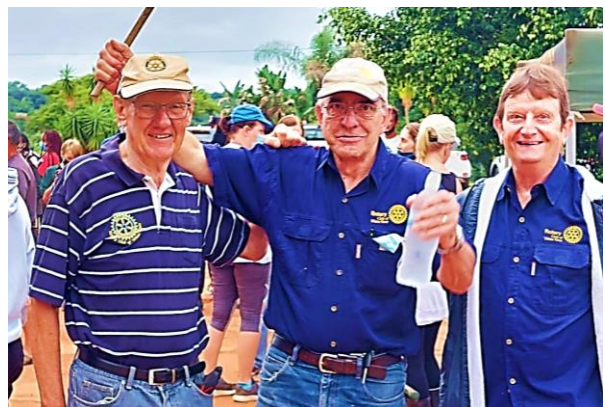
White River Rotarians were out in force