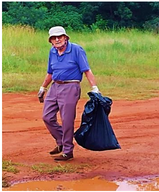
Everyone was there from our oldest Rotarian to...