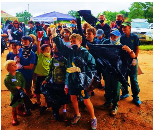
A group of school children from Uplands joined in the Big clean up

On Saturday 29 th January, Rotary, in conjunction with several other interested parties gathered at the Rugby club to clean up the White River Nature reserve, This is the start of a project to rehabilitate the Reserve and make it a space where residents of White River can walk, cycle and enjoy being close to nature.