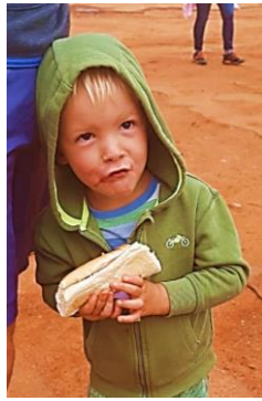
... the very young