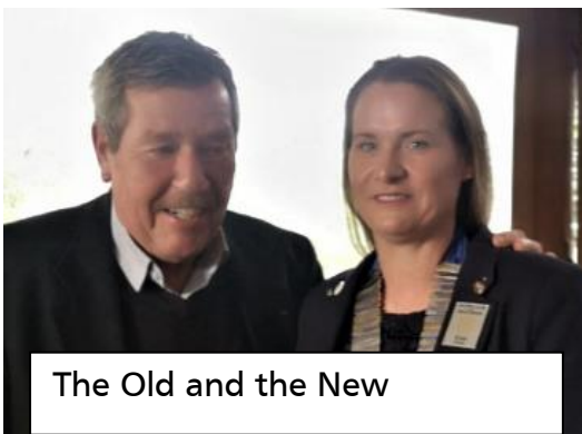
The Old and the New